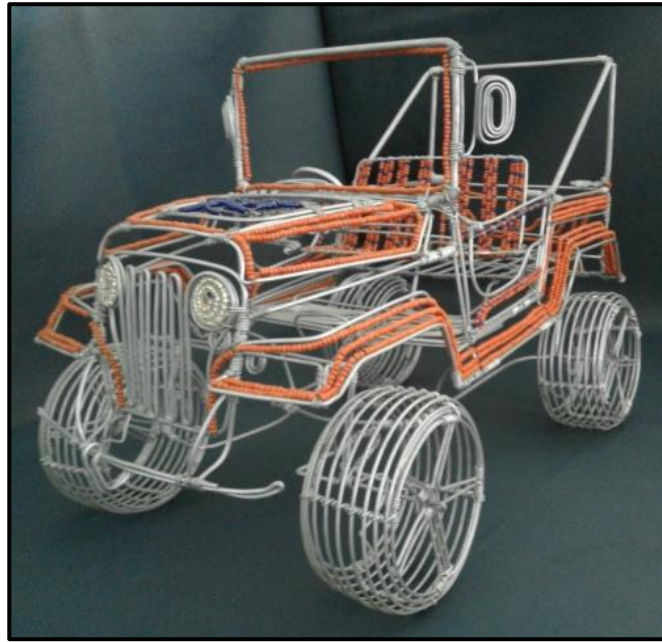
FIGURE E: Jeep Wire Car , designer unknown (South Africa), 2018.

3.1 Refer to FIGURE E and FIGURE F below and answer the question that follows.