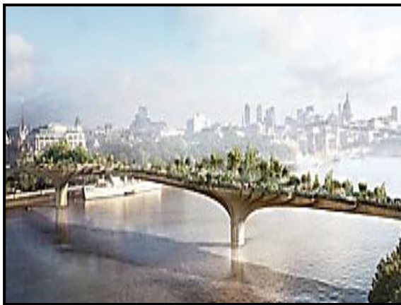
FIGURE H: Proposed London Garden Bridge by Heatherwick (England), 2013.