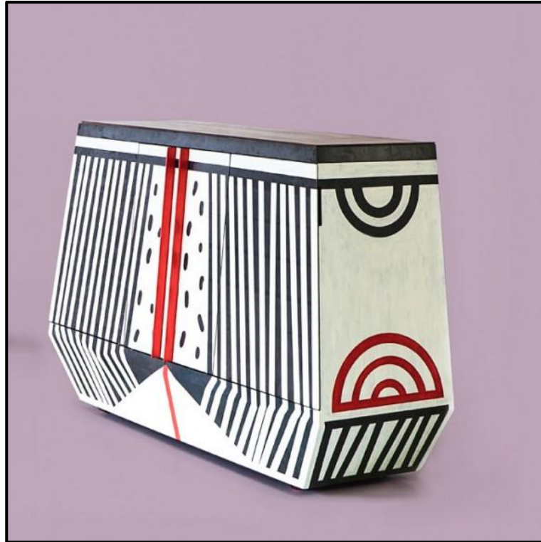
FIGURE L: Contemporary Design Furniture by Dokter and Misses (South Africa), circa 2015.