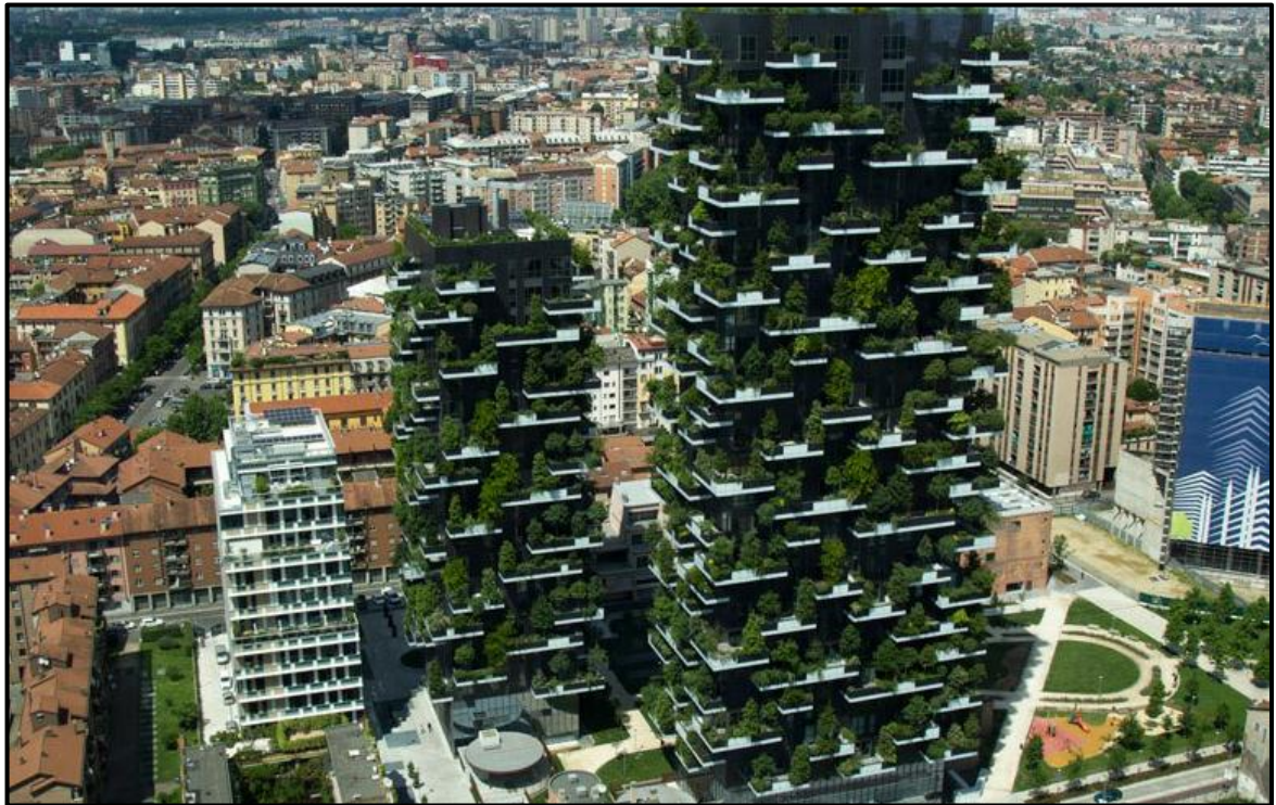
FIGURE N: Project: Residential Towers by Boeri Studio (Milan, Italy), 2009.

6.1.1 Explain THREE reasons why the building above promotes a healthy environment. (3)