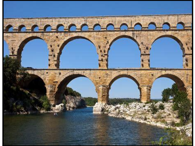
Aqueduct Pont du Gard