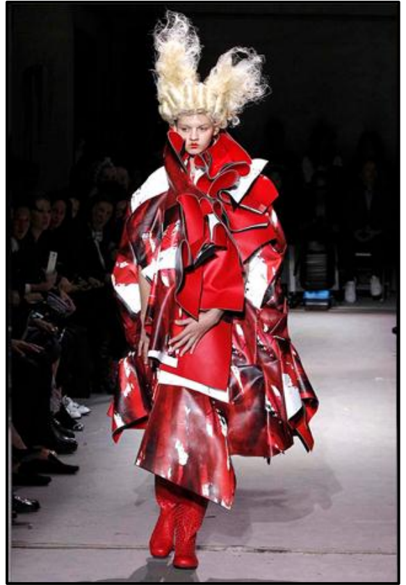
FIGURE J: Deconstructivist Dress Design by Rei Kawakubo (Japan), 2015.

Write a comparative essay of 200–250 words (ONE page) in which you discuss whether the above two designs reflect the design movements they represent.