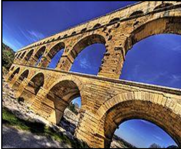
FIGURE G: Aqueduct Pont du Gard (France), 1st century CE.