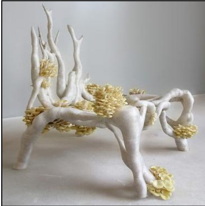
FIGURE B: Mycelium (Fungus and Straw) Chair by Eric Klarenbeek (Netherlands), 2012.

1.2.1 Explain the term biomorphic in relation to the design in FIGURE B above. (2)