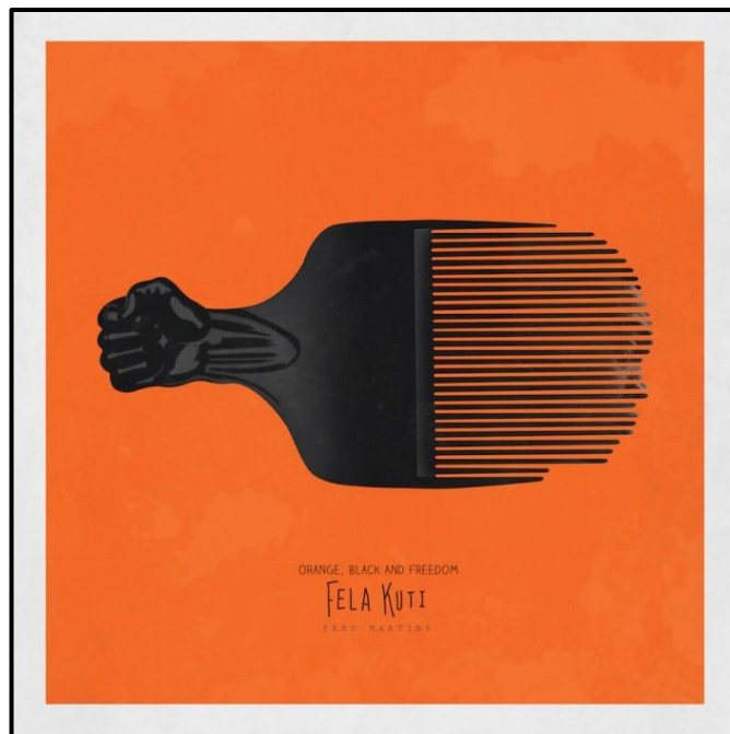
FIGURE D: The Afro Comb by Fred Martins (Nigeria), 2019.

Identify any TWO symbols in the design above and discuss their possible meanings.