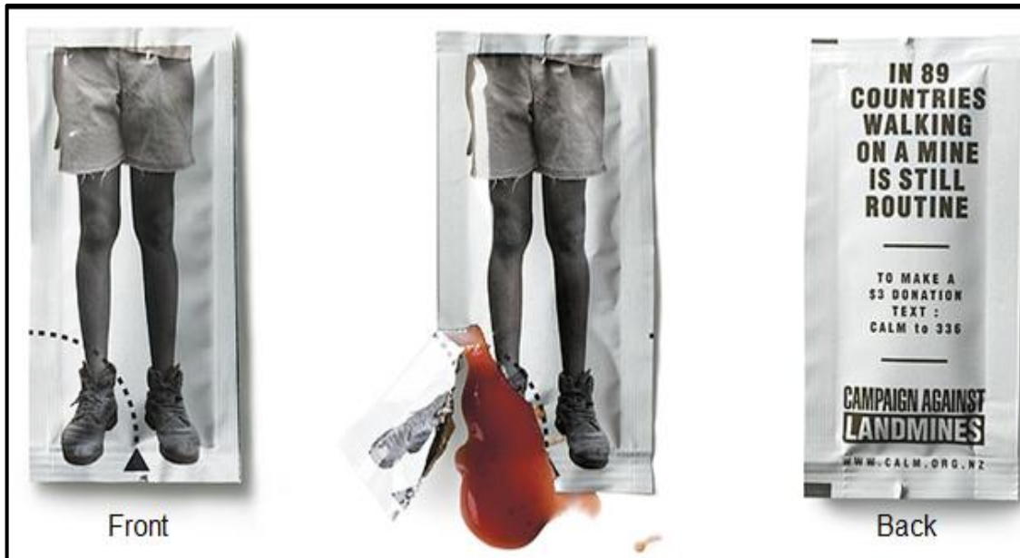
FIGURE K: Campaign Against Land Mines (CALM) by Publicis Mojo (New Zealand), 2006.