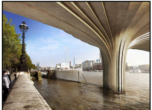
Detail of the Proposed London Garden Bridge by Heatherwick

Using your knowledge about Classical and contemporary architecture, write an essay of at least 200–250 words (ONE page) in which you compare the built structure in FIGURE G with the proposed structure in FIGURE H. Alternatively, you may compare any Classical building with any contemporary building that you have studied.