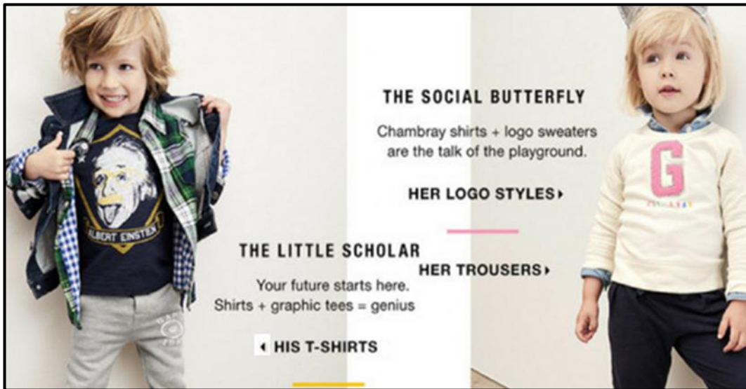
FIGURE C: GAP kids clothing range (UK), 2016.

2.1.1 Identify and explain the stereotypes that are used in FIGURE C above. (4)