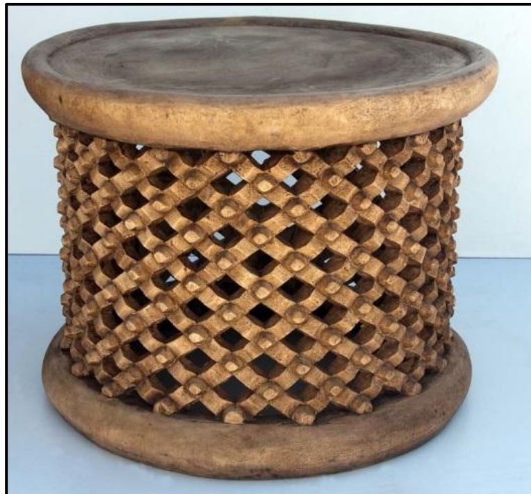
FIGURE M: Traditional African Bamileke Stool , designer unknown.

5.2.1 How does the contemporary furniture piece in FIGURE L differ from the traditional African stool in FIGURE M above? (4)