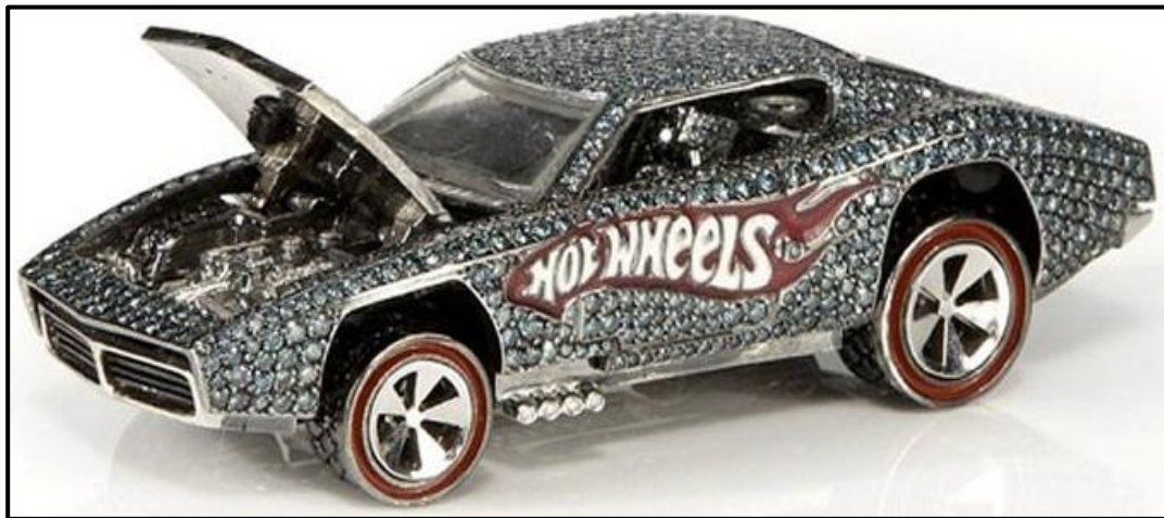
FIGURE F: Hot Wheels 40th Anniversary Limited Edition by Mattel (USA), 2018.

Write an essay of at least 200–250 words (ONE page) in which you compare FIGURE E with FIGURE F.