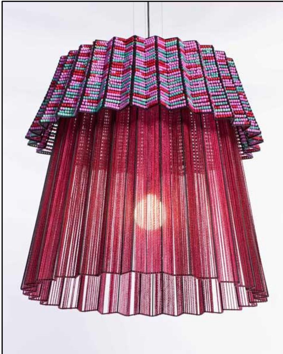
FIGURE A: Tutu 2.0 Pendant Light by Thabisa Mjo (South Africa), 2017.

1.1.1 Analyse the use of the following elements and principles in FIGURE A above: