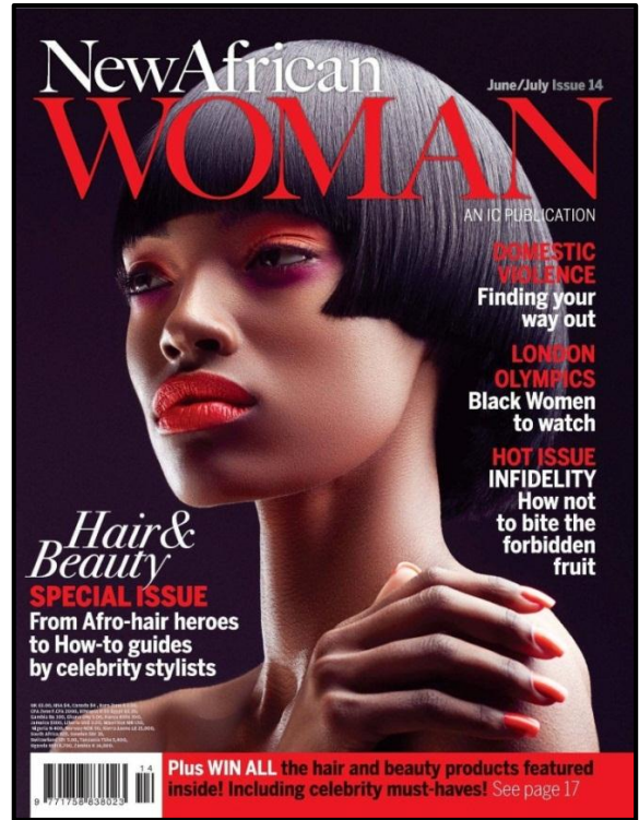
FIGURE E: New African Women Magazine Cover by IC Publications (London), 2014.

Compare the magazine cover in FIGURE D with the magazine cover in FIGURE E.