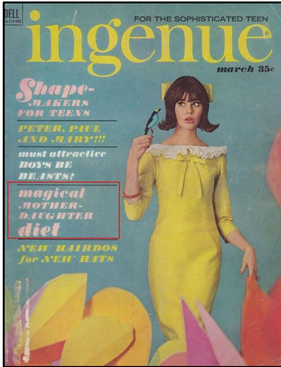
FIGURE D: Ingenué Magazine Cover by Dell Publishing Company (London), 1964.