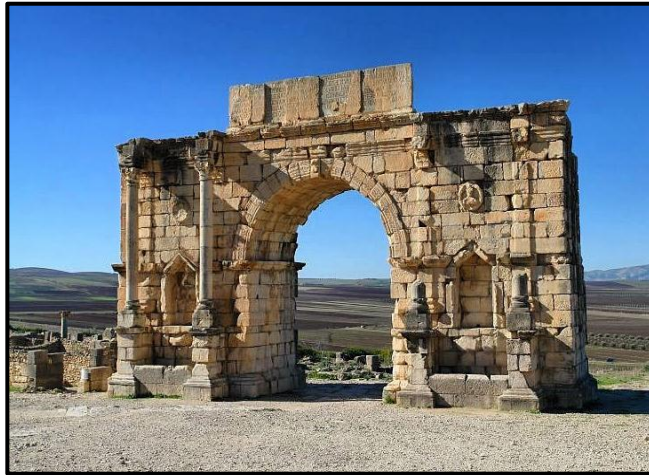
FIGURE F: The Arch of Caracalla , an ancient Roman city of Volubilis, commissioned by governor Marcus Aurelius Sebastenus (Morocco), 217 ACE.