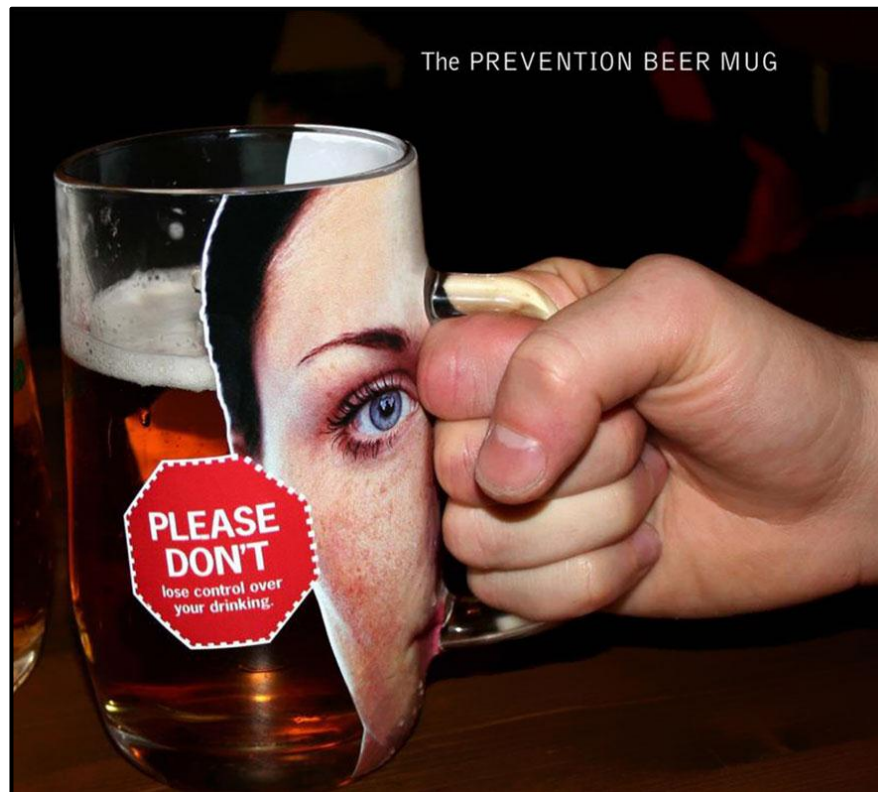
FIGURE J: Prevention Beer Mug Poster by EURORSCG Advertising Agency (Czech Republic), 2008.

5.1.1 Discuss how the message of the poster campaign in FIGURE J above is communicated by referring to the designer's use of layout and symbolism. (4)