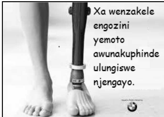
[Uthathwe kwi-Awardwinning pictures.com waza wahlelwa]